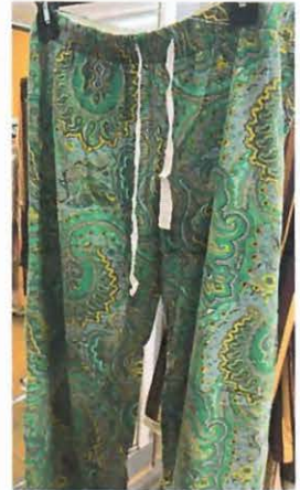
Women's Pants - look for wide legs.